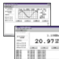
PC Capture of Graphic Display and Data Acquisition. Software Included.