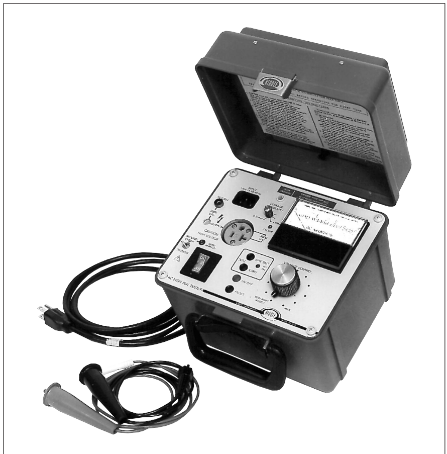
AC High-Pot Tester with supplied leads