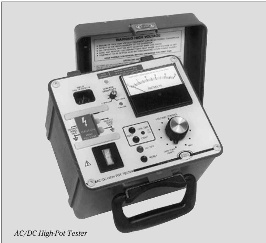
AC/DC High-Pot Tester