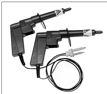
Optional pistol-grip leads