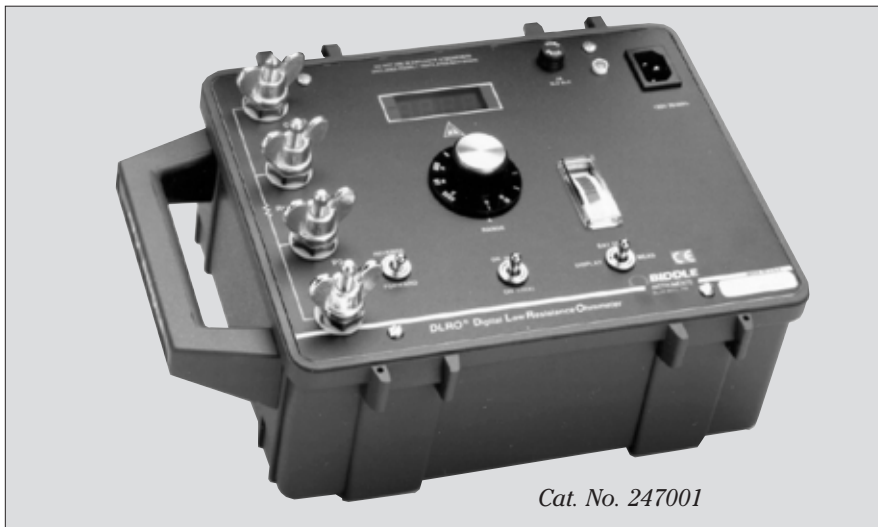
Cat. No. 247001