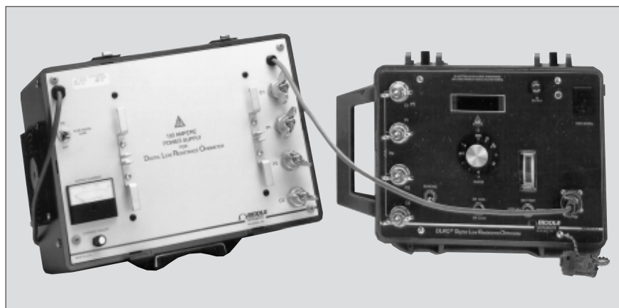
Low-Range/High-Current Model Cat. No. 247101 consists of a Single-Pak DLRO, Cat. No. 247001-3, and separate 100 ampere test current supply, Cat. No. 247120. The 100 ampere supply also may be ordered as an option.