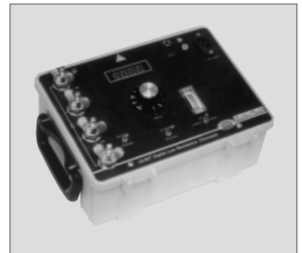
The Low-Range DLRO, Cat. No. 247002, features an extra range and rugged, Single-Pak design.

For 100 ampere measurements, an interconnecting cable from the 100 ampere current supply module is plugged into a special receptacle on the measuring module.